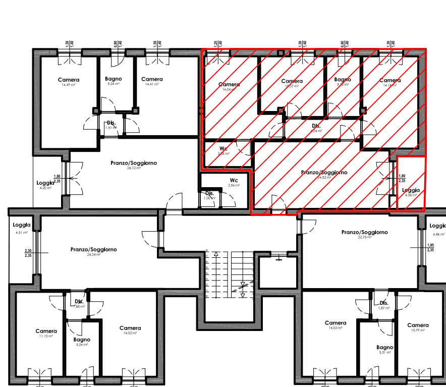
INQUADRAMENTO SCALA 1:200